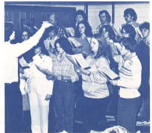
Alumni Chorus in rehearsal