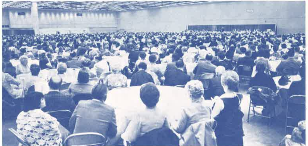
Partnership Dinner VI in 1977, Cobo Hall