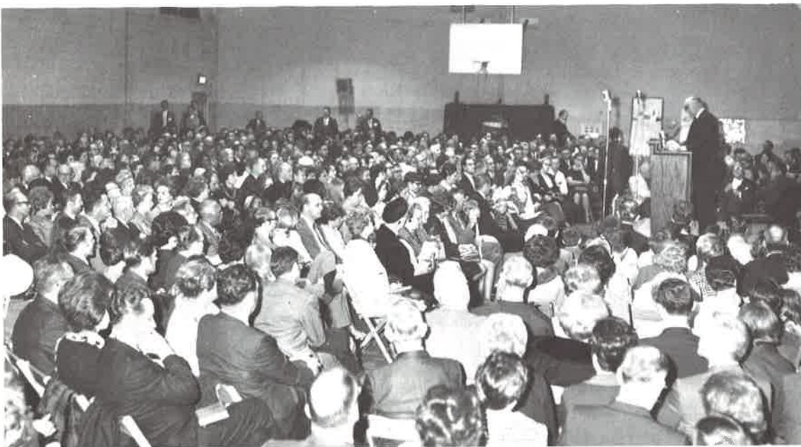
MCC's October (12 Annual) Lectureship drew some of the best crowds ever. Pictured above is the Thursday night audience.

Michigan Christian College and all Lectureship guests are grateful to the fine preachers and teachers who, through the years, have generously given of their time to make MCC Lectureships spiritually great events.