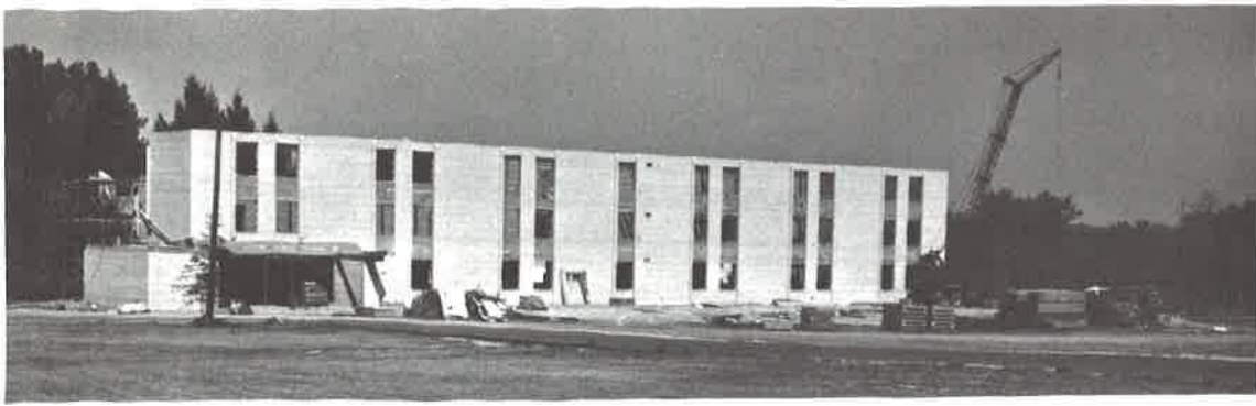
Pictured above is the Alma Gatewood Memorial Dorm as it appeared in mid-October. With the three stories the dorm will house 144 women students and is designed in suites of four. Women students will have a lovely home this September.