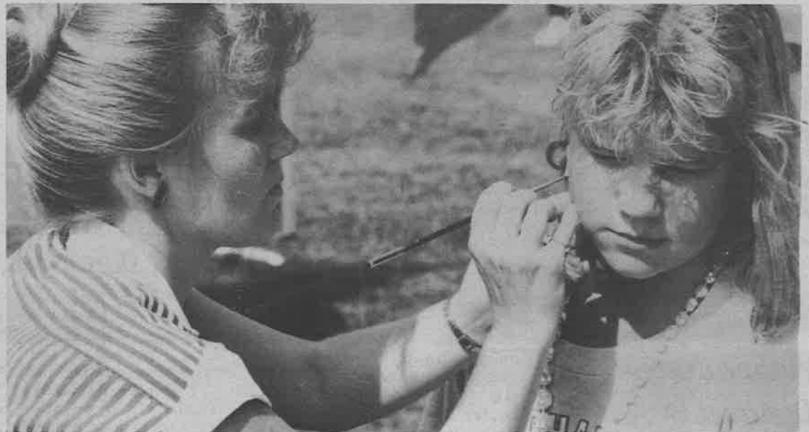
A child waits patiently as a design is painted on her face in beautiful, washable colors.