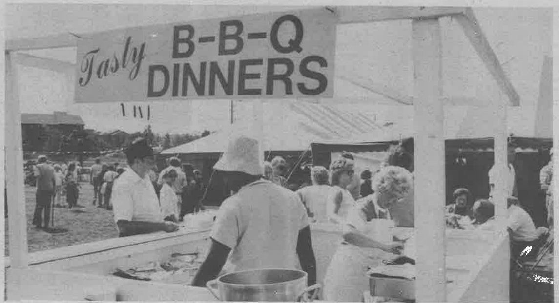
Barbequed Dinners are enjoyed by many Fall Festival guests on the brisk, fall day.