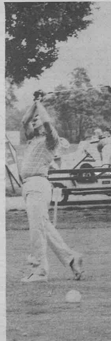
A Detroit Area Golf Classic participant works on his stroke before he and his group tee off.