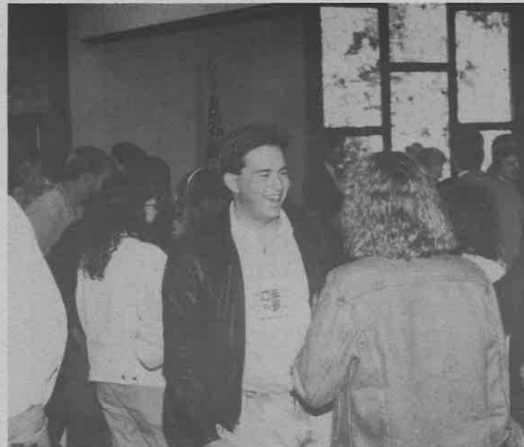
Students meet new friends, and renew old acquaintances at the first Chapel Service of the 1988-89 school year.