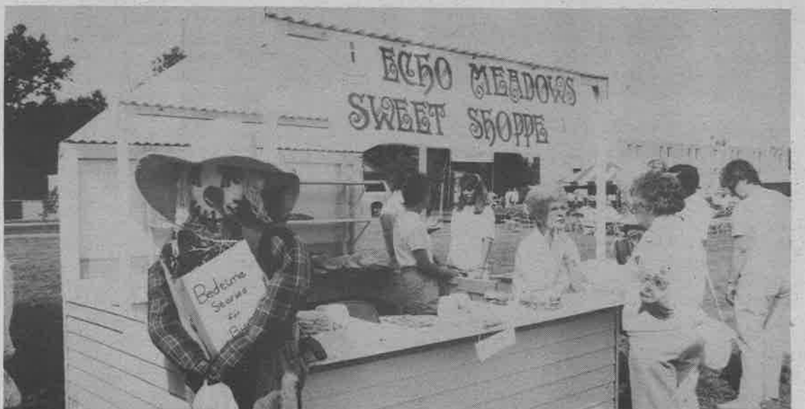
The Echo Meadows Chapter, of Toledo, Ohio, tempts the sweet tooth of every passerby with cookies, candies, and other goodies.