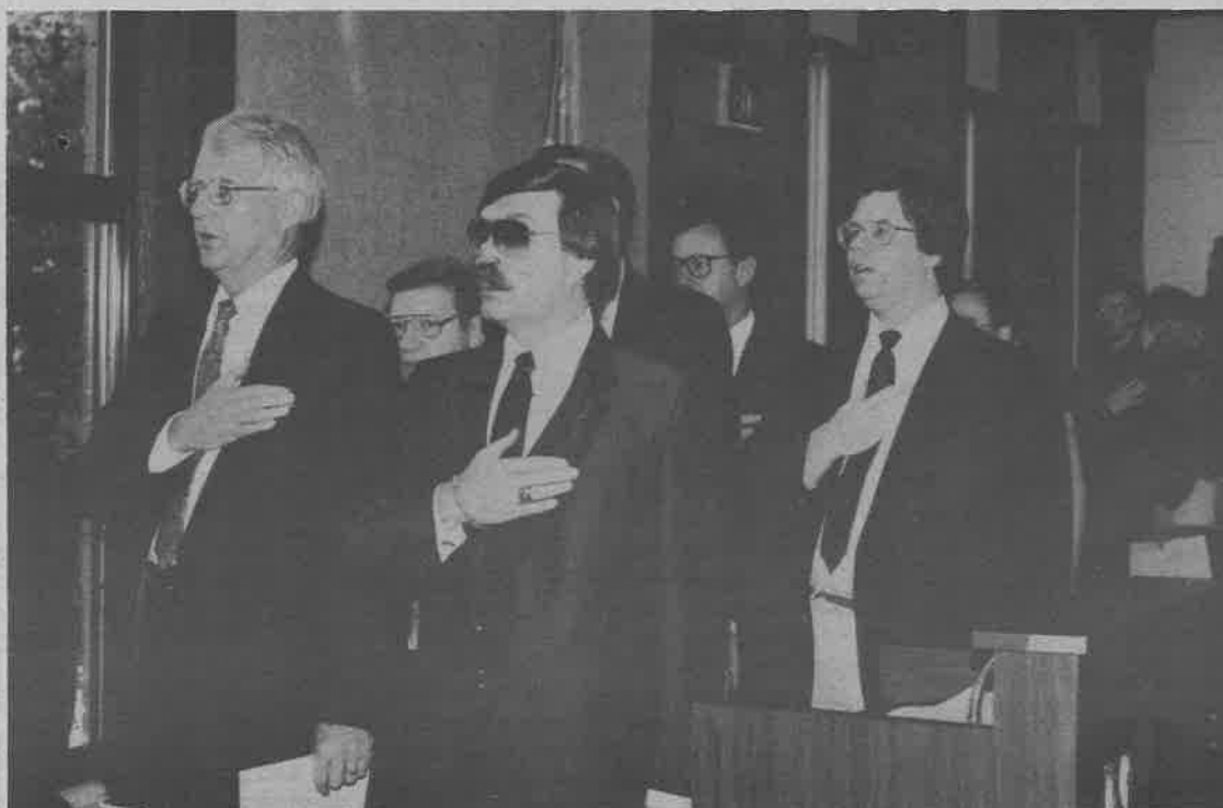
Opening Day Chapel platform guests, and the entire audience, participate in the Pledge of Allegiance.