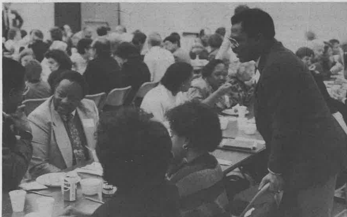
Attendees at the MCC Christian Ministries Workshop, in Ontario, Canada, discuss morning class sessions.