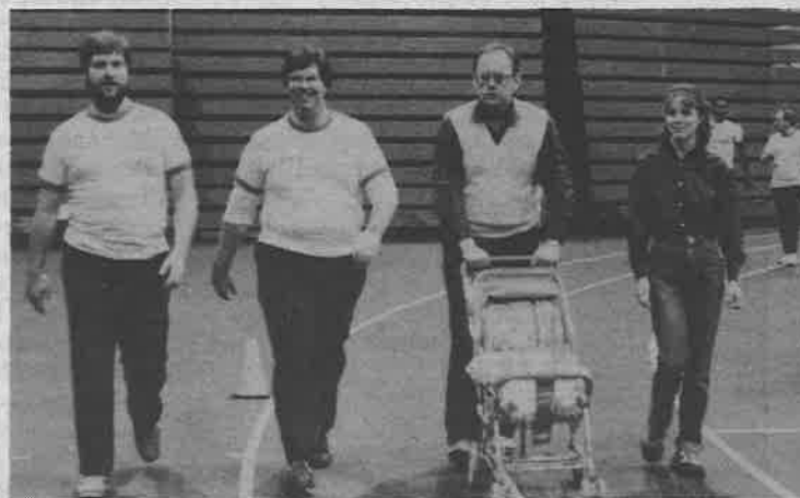
MCC employees support the efforts of the College, while enjoying fellowship with each other.