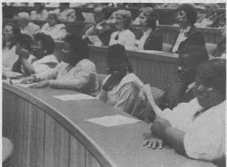
A devotional in Kirsch Auditorium, on Western Michigan University's campus, provides further fellowship for Partnership Dinner West II attendees.