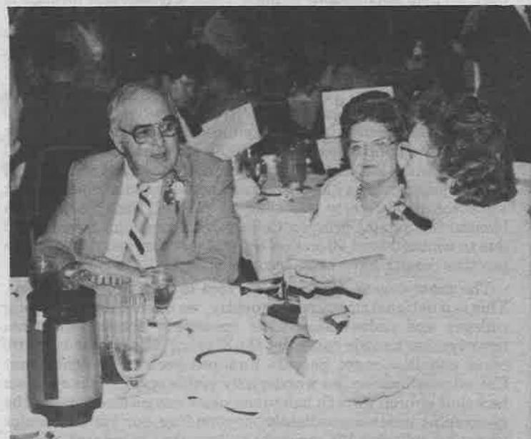
Partnership Dinner XVII guests enjoy a time of fellowship before the meal is served.