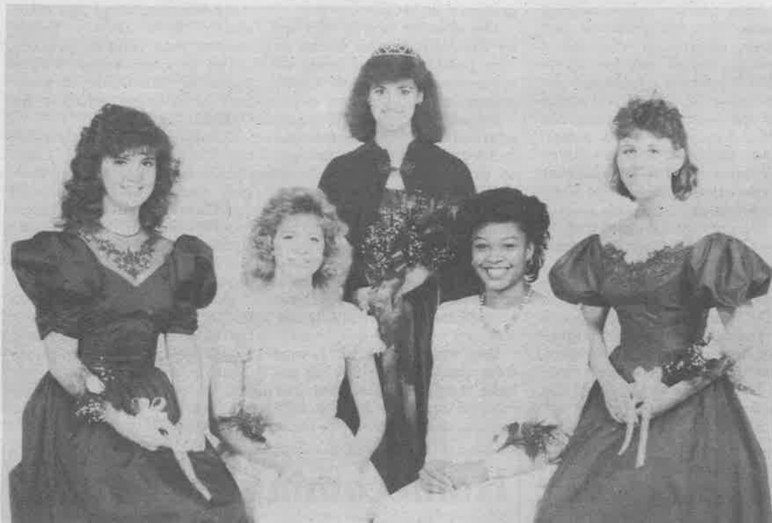
H.A. Powell Studios