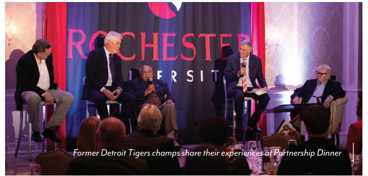
Former Detroit Tigers champs share their experiences at Partnership Dinner

About 350 people attended RU's 52nd annual Partnership Dinner on April 22, which featured a panel of former Detroit Tiger players from World Series championship teams.