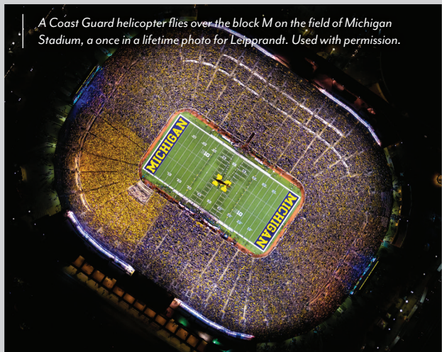
A Coast Guard helicopter flies over the block M on the field of Michigan Stadium, a once in a lifetime photo for Leipprandt. Used with permission.

Visit www.michiganskymedia.com to view and/or purchase any of Leipprandt’s photos.