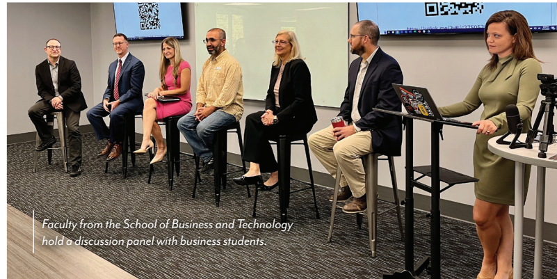
Faculty from the School of Business and Technology hold a discussion panel with business students.