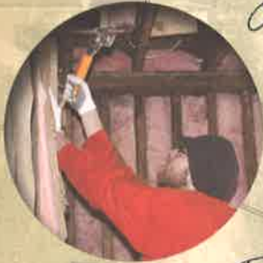
IMAGE is a student-lead missions organization whose goal it is to serve other people. Frequently, IMAGE goes downtown to help care for the homeless of Detroit by providing food, clothing and toiletries. Other IMAGE activities include visiting children housed at the nearby Pontiac Rescue Mission, organizing spring break and summer mission campaigns, and raising both funds and awareness for Habitat for Humanity.