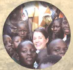
IMAGE: Serving God by Serving Others

With several faculty members who have served as long-term missionaries and students who make plans to follow in their footsteps each year, opportunities for international mission work abound at Rochester College. Each time there is a break from classes, mission teams head out into the world to reach those in need. Groups from the college have worked in Kenya, Uganda, Honduras, the Ukraine, Thailand, Australia and Brazil.