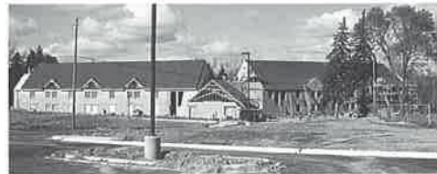
Construction transforms campus appearance.