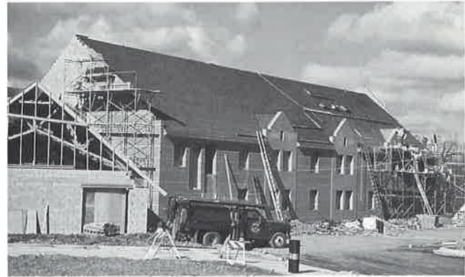
Workers complete brick and roofing on one of the residence halls.