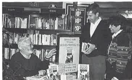
Barnes & Noble sponsors a Good Kids signing.