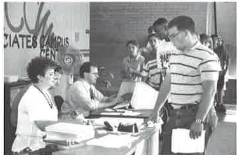
New students join a growing student body at MCC during the last fall registration period.

While applications continue to arrive daily, residence hall space is filling quickly. Students interested in enrollment for the fall 1994 term should apply for admission and secure their room in a residence hall as quickly as possible. Admission packets and housing information are available by calling the Admissions Office at 1-800-521-6010.