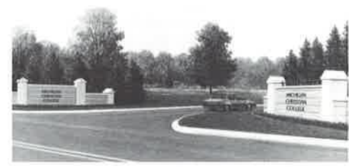
New entrance signs enhance campus beauty.

The new residence halls will each house seventy students. Arranged in suites with private bathrooms, each will include a central kitchen area for student use. Individual rooms will be fully furnished and equipped with telephone service.