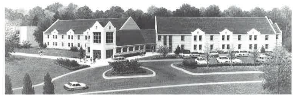
Flanked by new residence halls, a campus commons provides additional student social space.

Relocation of the main college entrance during the construction process will allow the college to add new roadways and parking areas, as well as an attractive new entryway. The entrance will enhance the natural beauty of the campus, and promote a striking collegiate image for Michigan Christian College.