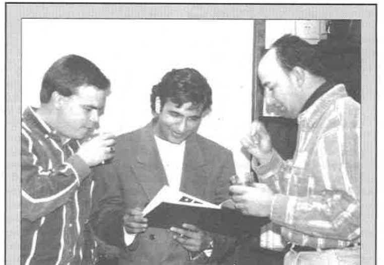
Alumni celebrated a New Time of Year and Old Traditions at Homecoming on November 4. With a new date during the fall semester, the day included the traditional activities of chapel, an alumni luncheon, and the Homecoming game and ceremonies. The classes of 1980 and 1990 held special reunions.