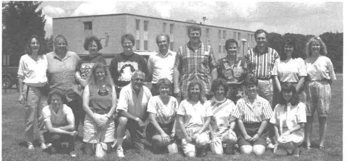
Friends from the class of 1975 gather in front of the Alma Gatewood Residence Hall for a group picture.