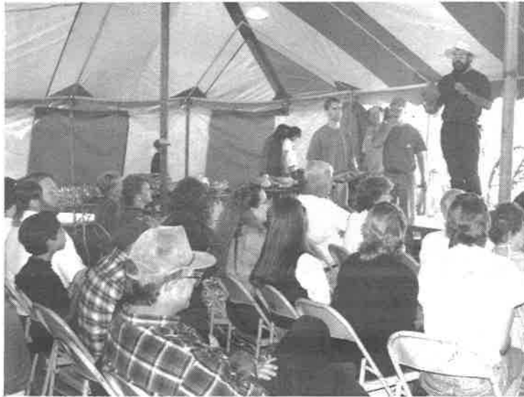
Auctioneers make use of the Fall Festival crafts tent for their activity.