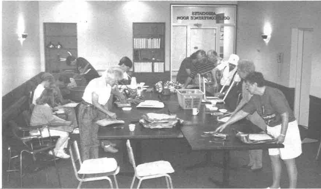
Volunteers form an assembly line to recover chairs in the renovated Associates Gold Conference Room.