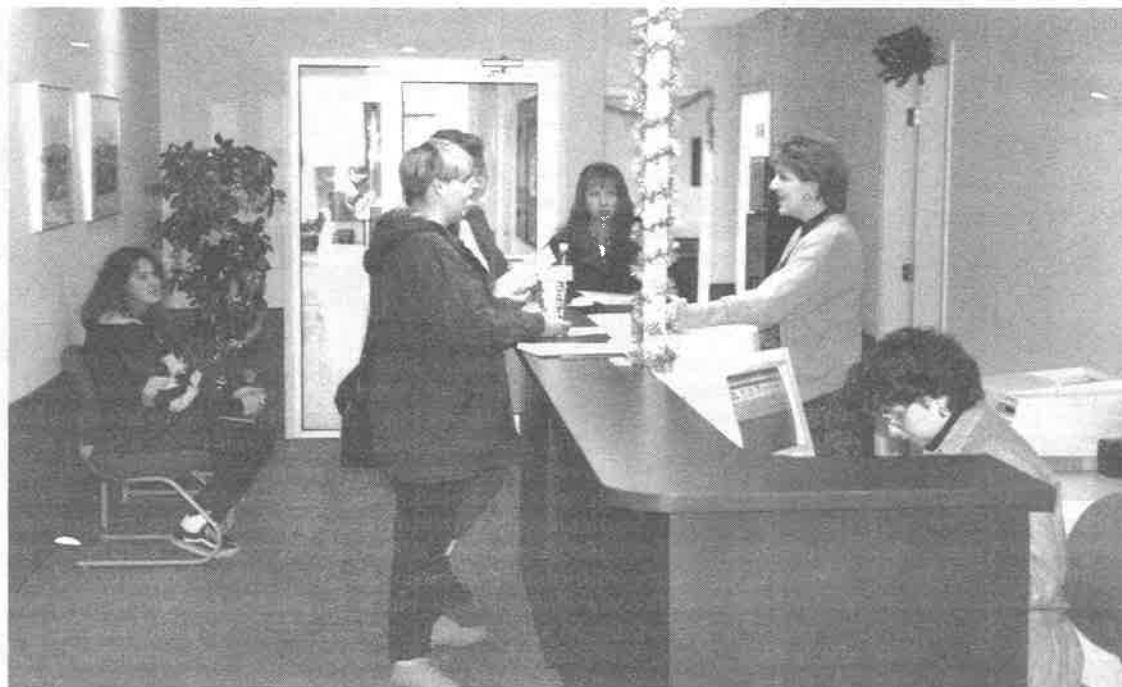
Students visit Dean Cain in the renovated Academic and Student Services Office wing of Campus Center.

west wing of the Associates Campus Center along with the central portion of the building before classes began in 1959. Female students used the west wing for housing from 1965 until the Alma Gatewood Residence Hall opened in 1972. Other than routine painting, carpeting, and minor changes in doorways and ceilings, students experienced few changes in the wing until the recent renovations took place.