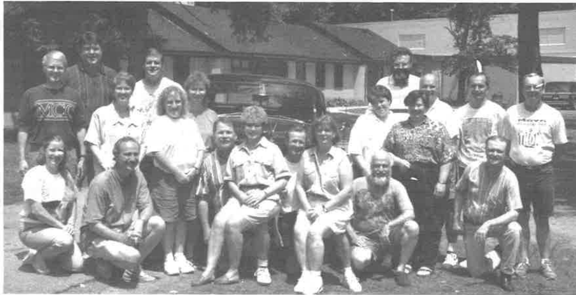
Classmates pose in front of the Science Center with a Marvin King Packard at the class of 1970 reunion.