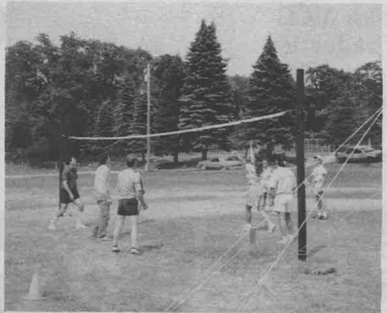
A reunion volleyball game is one of the weekend's highlights for these former MCC students.