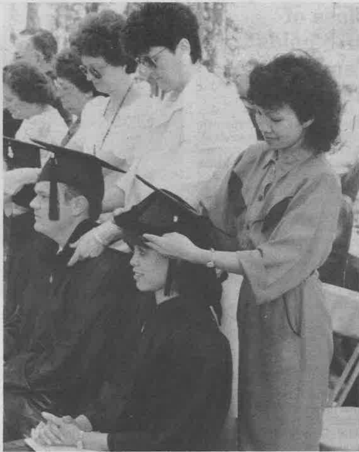
Graduates are hooded by parents and friends, during commencement exercises.