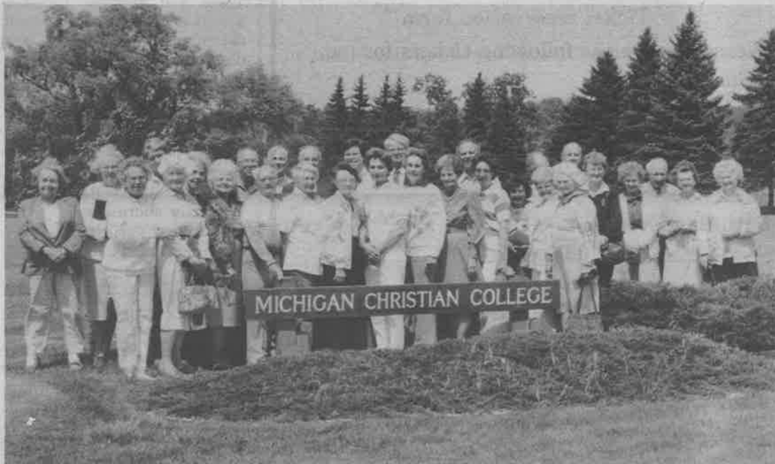
Attendees at MCC's second annual Elderhostel enjoy a beautiful summer day, during their week on campus.