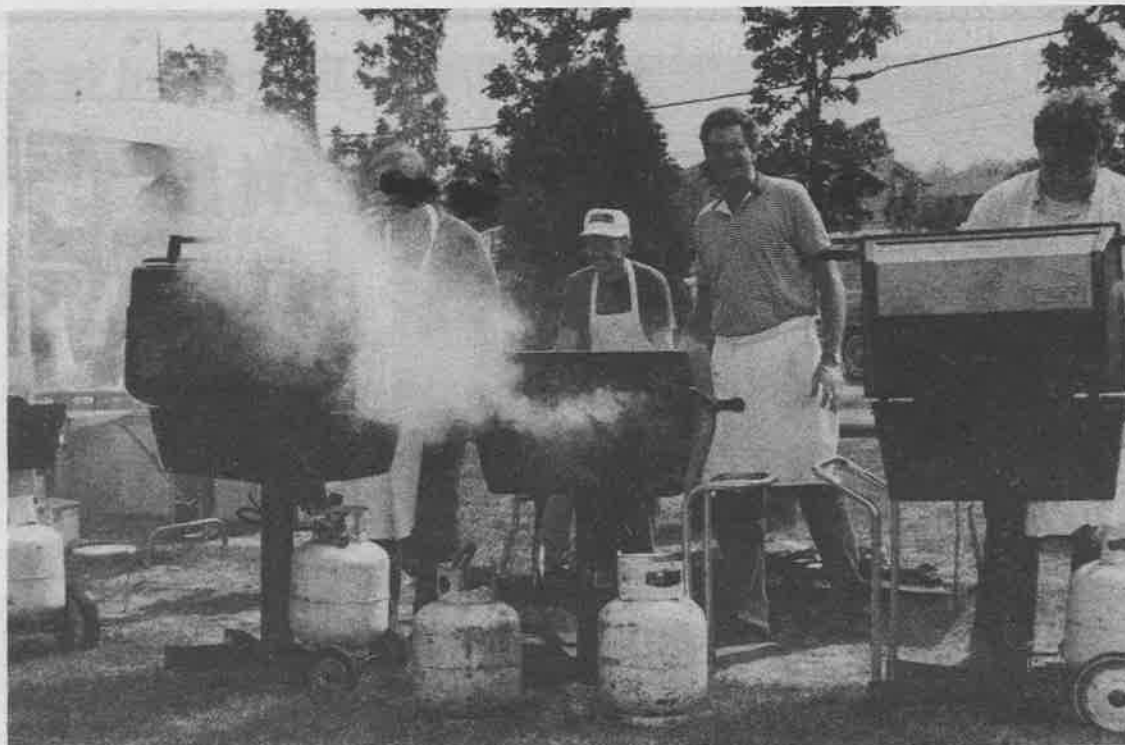
Manning the sizzling steersburgers at the Fall Festival are dedicated members of the Men's Club chapter from the Echo Meadows congregation in Toledo, Ohio.