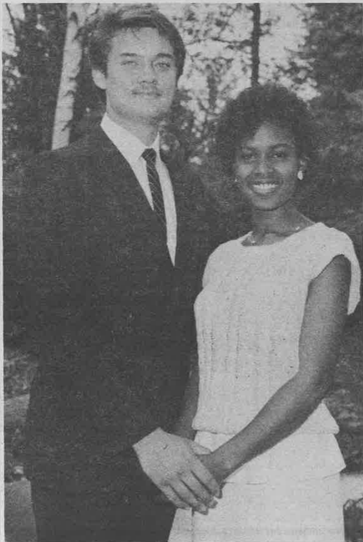
Mr. and Miss MCC — Dan Boren and Sonja Barcus.