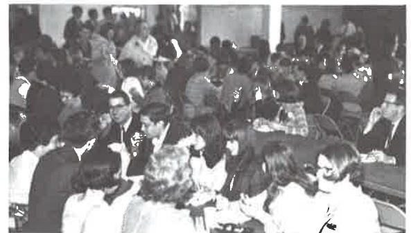
A guest of the 1968 Senior Day is shown (extreme left) engrossed in the day's formal assembly program and (above) the crowd enjoys the annual Senior Day Luncheon.