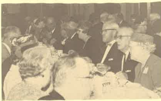
MCC Lectureship offers wonderful inspiration at every session and the various banquets and luncheons are a delight to all.