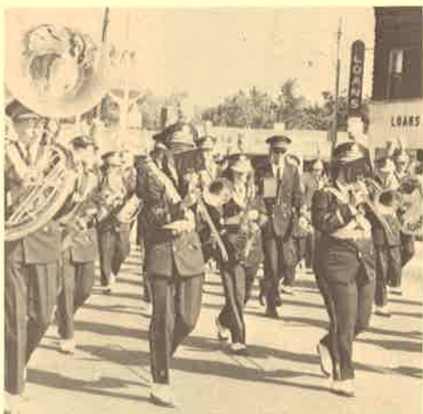
The Marching Band of the Rochester High School is a feature in the Annual Fall Festival Parade October 7.

The Festival parade through the streets of Rochester will begin at 10 a.m. and the new Festival Queen for 1967 will be crowned at the conclusion of the parade on the parade MCC campus.