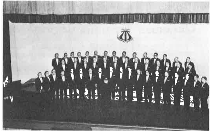
Ukrainian Men's Chorus "Trembita" of Detroit, Michigan