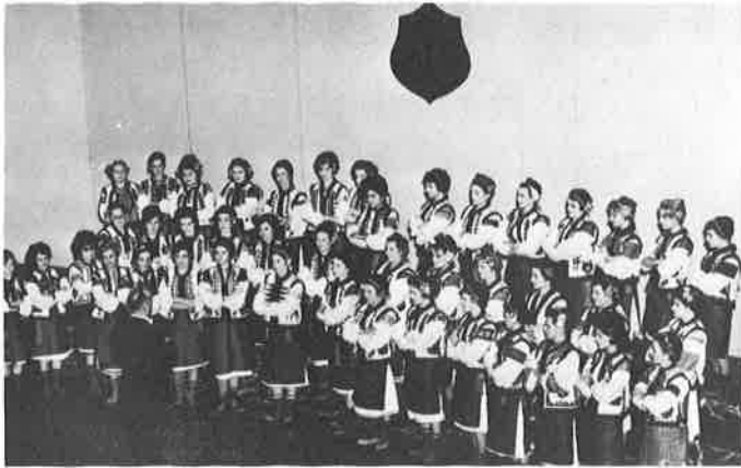
Ukrainian Women's Chorus "Trembita" of Detroit, Michigan