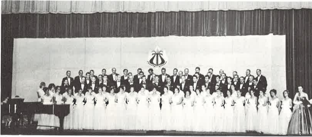
The famous 80-Member Ukrainian Trembita Chorus.