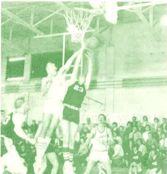
The MCC Warriors won the Second Place Trophy in the 1965 MCCA Playoffs in Lansing, Michigan.