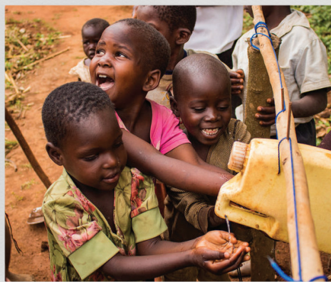
WASH Program in Africa