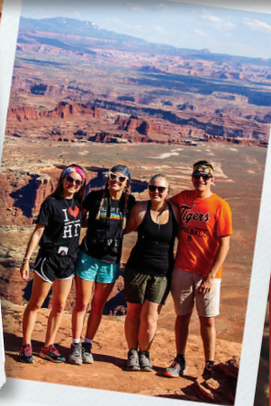
Explore the Western U.S.