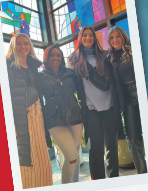
Civil Rights Tour

These co-curricular trips provide a short-term, low-cost learning opportunity, typically during Spring Break. On one trip, a group from RU spent a long weekend diving into the rich history of the Civil Rights Movement in Chicago. Reflection, assessment and open dialogue, coupled with sightseeing and time spent in community, are always key components.