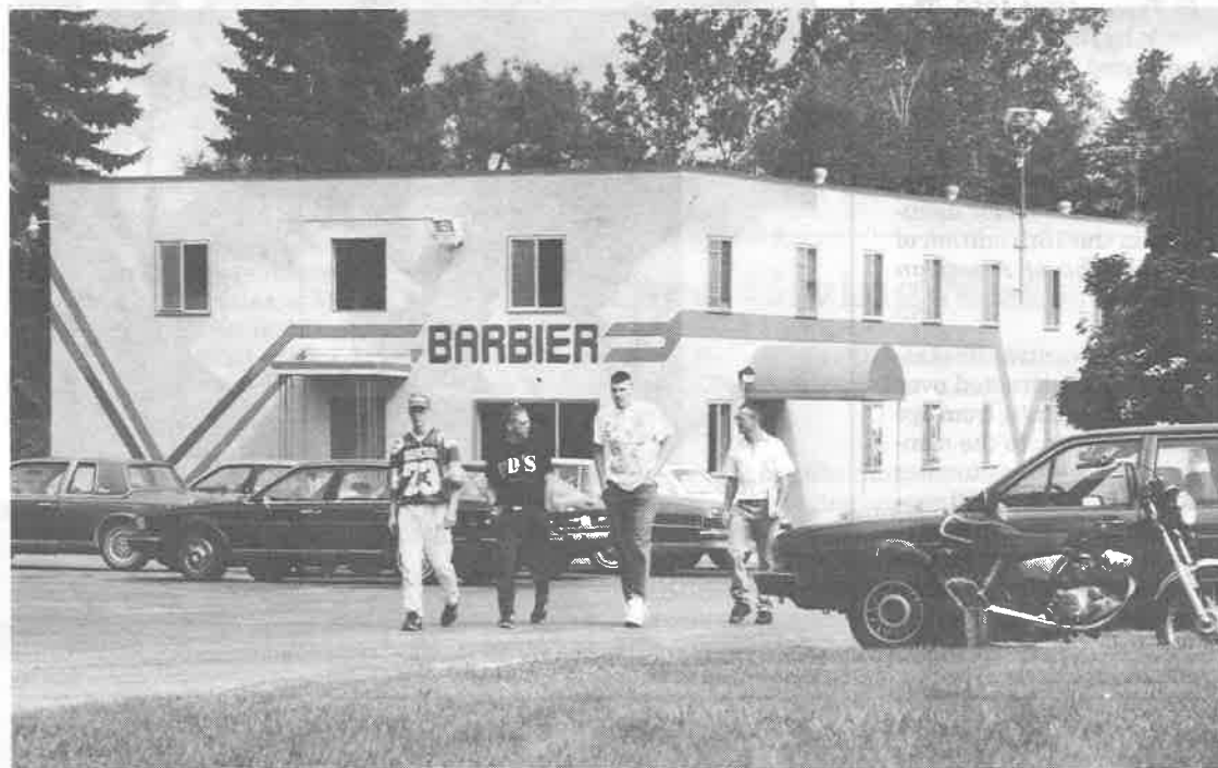
Barbier Residence Hall portrays a new image after the completion of outside renovation work.