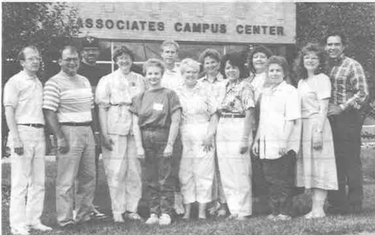
Class of 1967 members pose in front of the Associates Campus Center.

The class of 1982 rounded out the summer reunion schedule with their ten-year reunion on July 31 and August 1. Following a catered barbecue dinner, the group enjoyed a slide presentation that class members originally presented at their Spring Awards Banquet.