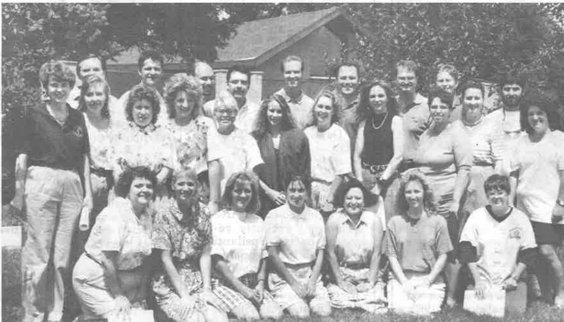
Ten-year reunion guests from the class of 1982 gather near the Westside Central Chapel for a photograph.

For information call the Public Relations Office at (313) 651-5800