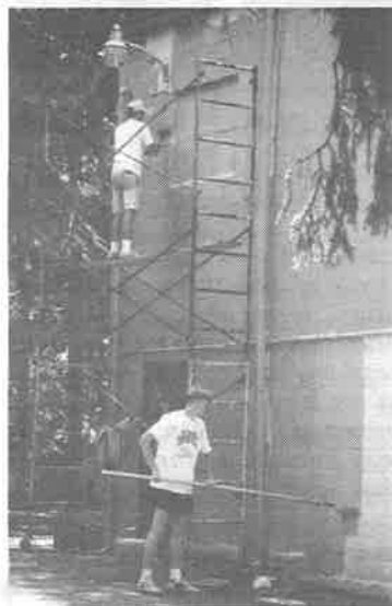
Student workers paint the gym.

Over a four-month period, workers applied over 370 gallons of paint, redecorated a number of areas, removed the trailer previously used by the Development Office, and completely renovated two facilities. Contractors supplemented those efforts by replacing three roofs, installing a new campus-wide phone system, and com-