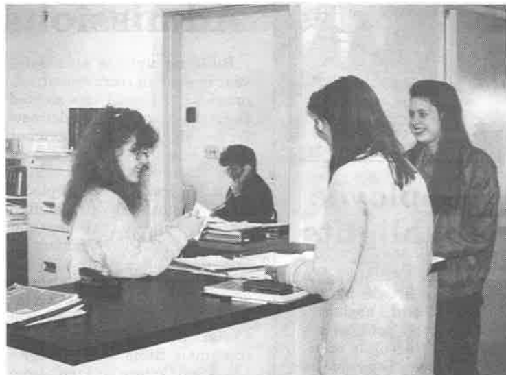
Assistance is provided in the library's renovated circulation center.