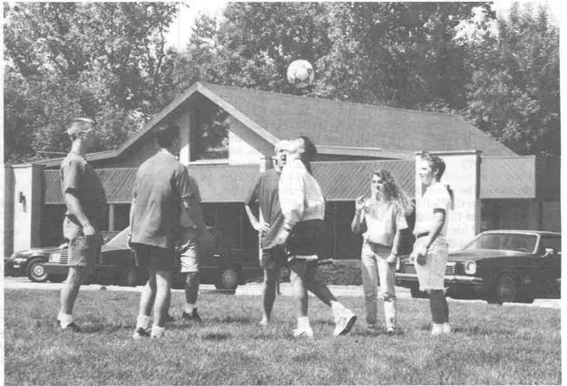
Soccer players practice ball-handling on the front lawn to pass time on a sunny fall afternoon.