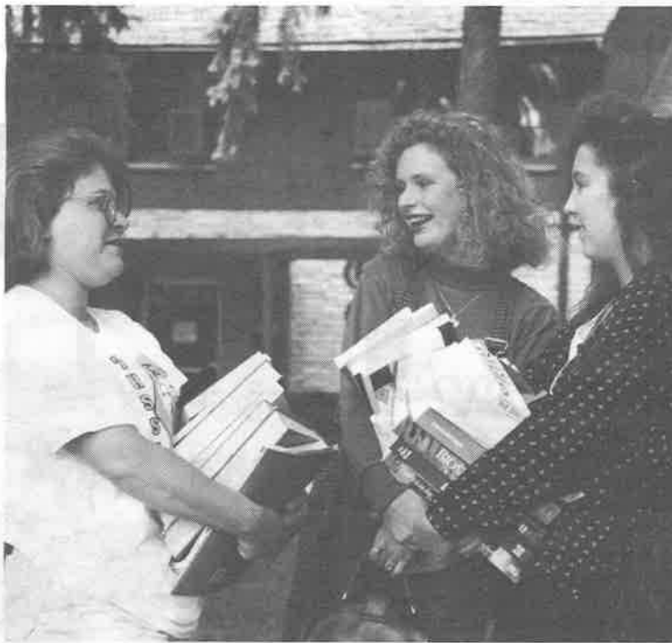
New students compare book purchases at the beginning of the year.

stated, "With an enrollment increase of 24% this year, MCC's future seems very bright. Our Admissions team is talented and hard-working, so there's no doubt in my mind we will see similar increases in the coming years. I look forward to the challenges that lie ahead."