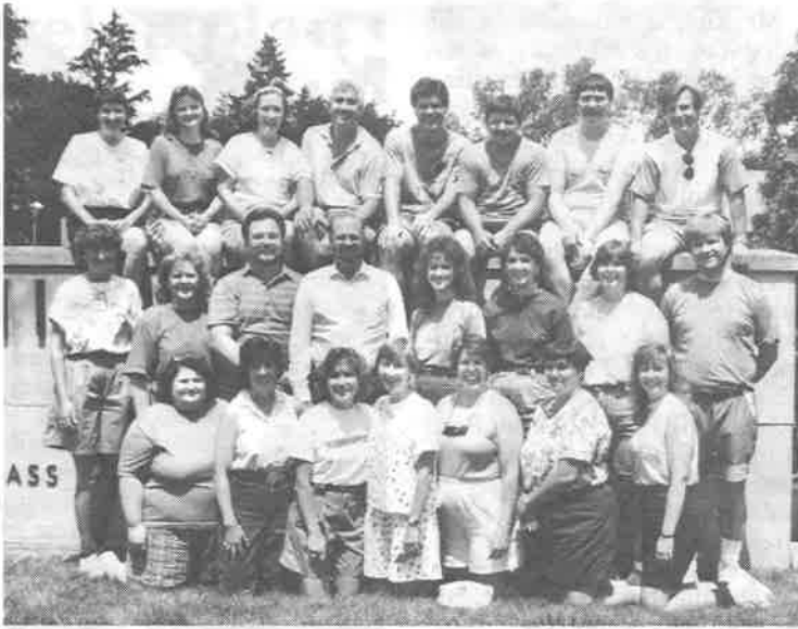
Members of the class of 1977 pose on the brick sign in front of campus.

Members of the college's first graduating classes attended a July 17-18 reunion, hosted by the class of 1962. During a cloud-burst that occurred at the end of a picnic by Lake Norcentra, re-