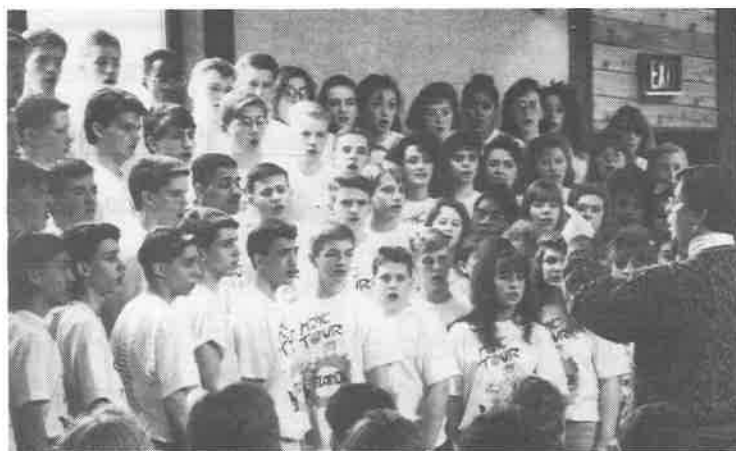
Metropolitan Detroit Youth Chorus sings for a chapel audience.

adult student complete courses due to her encouragement. Fay, who lived in a residence hall, described the younger students as "confidants and friends." Each adult student touched the lives of other Michigan Christian College students as they were touched.