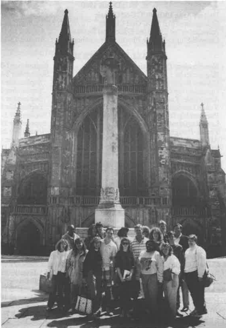
Winchester Cathedral looms above the England tour group.