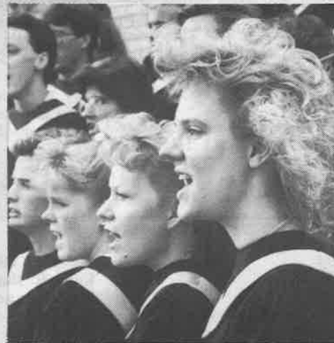
Now ... Joyful songs fill the air as the 1989-90 A Cappella Chorus performs a number.