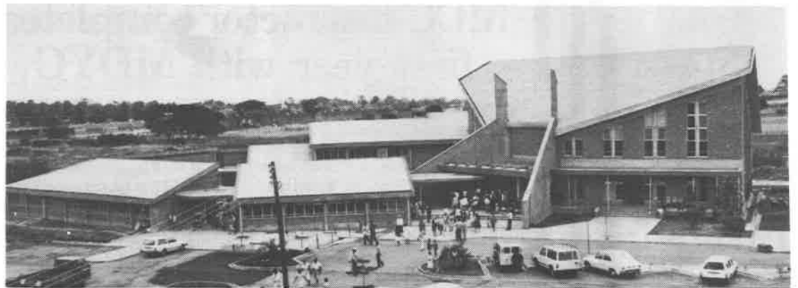
Facilities built from funds raised through "Target Nairobi" benefit Christians in Kenya.