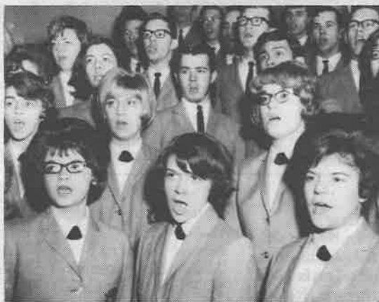
Then ... Members of the 1965-66 A Cappella Chorus proudly display new gold blazers.