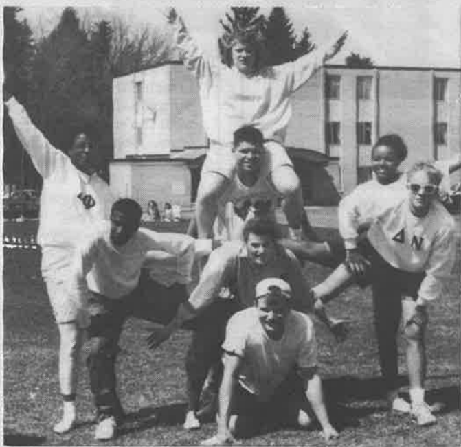
Relive the excitement of Beautiful Day! Begin planning now for an October 6 Alumni Beautiful Day activity with friends from your days at Michigan Christian College!

Please note children's names, recent births, job changes, marriages, promotions, etc., on a separate sheet.