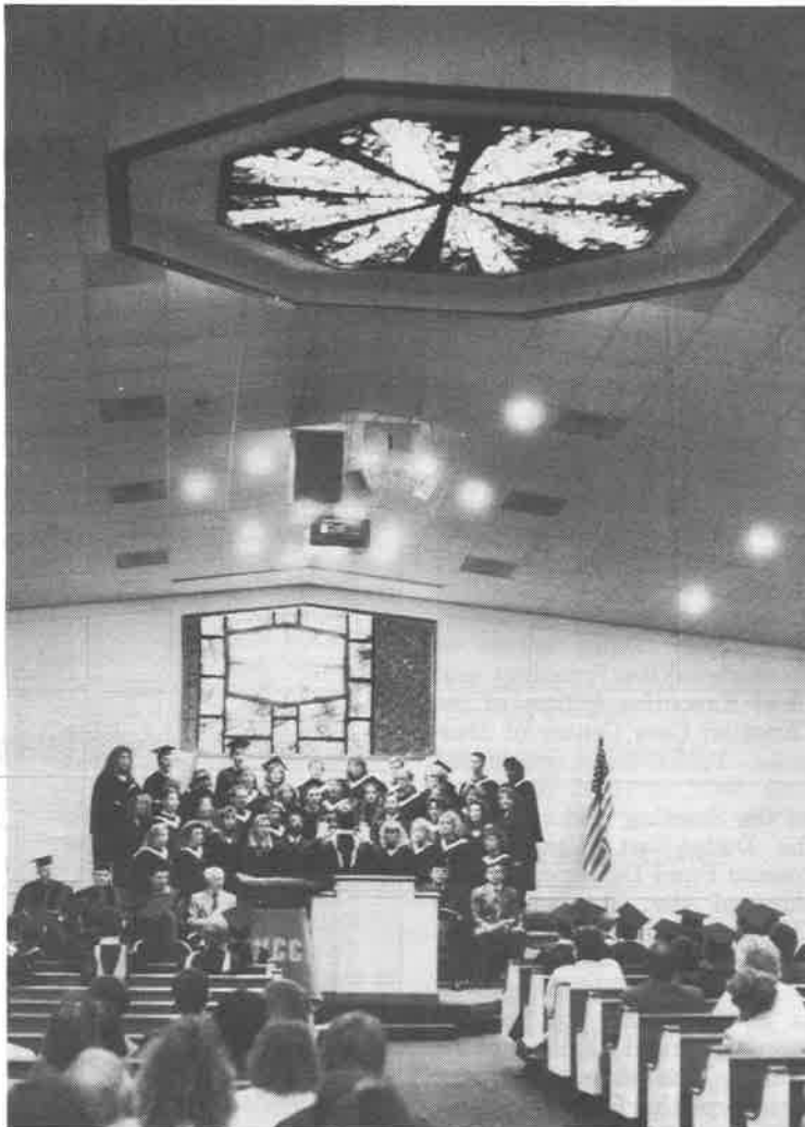
Chorus members sing for family and friends at graduation.