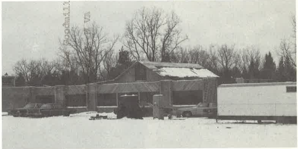
Nearing completion, the Westside Central Chapel and Utley Student Center, is roofed and is now waiting for interior to be finished.

the aid of sliding partitions can be converted into classrooms. Brown velour opera chairs that convert to desks will form the side tiered seating sections. The center section will consist of molded plastic stackable chairs.