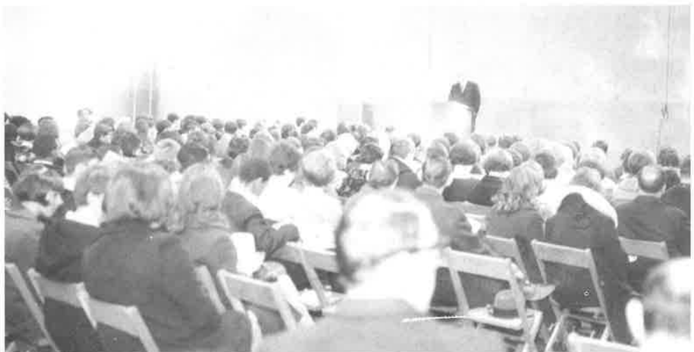
A portion of the High School Day Crowd in 1968 is shown above as President Palmer extends a welcome to all guests.

1959 - 10 YEARS' PROFILE IN PROGRESS - 1969