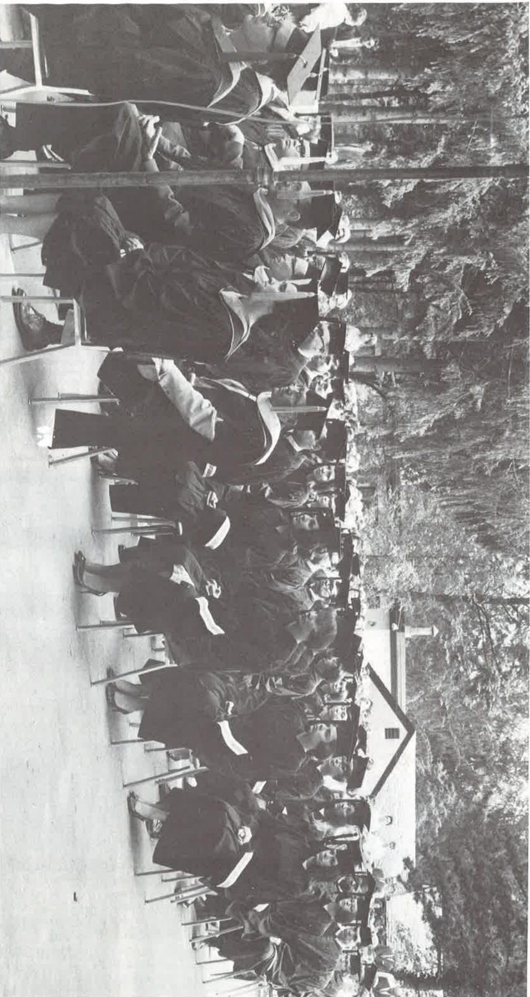
Michigan Christian College graduated the largest class in history on June 3 as exercises were conducted under the pine trees on MCC's picturesque campus.